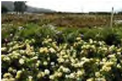
The agricultural industry is integral to the Region's economy.

The Building Industry Association of Southern California – Los Angeles/Ventura Chapter (BIA LA/V) role is to ensure land-use planning and growth management within the Antelope Valley is incorporated in this IRWM Plan. The building industry entities involved include two chapters of the Building Industry Association, the Antelope Valley Chapter and the South Eastern Kern County Chapter.