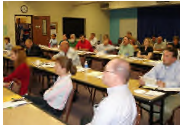
The Stakeholder process was started during the original formation of the Antelope Valley RWMG.

An extensive stakeholder outreach process is crucial to ensure that this IRWM Plan reflects the needs of the entire Antelope Valley Region, promotes the formation of partnerships, and encourages coordination with state and federal agencies. One of the benefits of this planning process is that it brings together a broad array of groups into a forum to discuss and better understand shared needs and opportunities. Residents of the Antelope Valley Region are facing changing conditions that increase the likelihood of serious disruption in water-related services or long-term degradation of water supply or environmental resources. Agencies and planning jurisdictions must work closely together in order to assure the delivery of good quality, reliable water while maintaining the quality of life in the Antelope Valley Region.