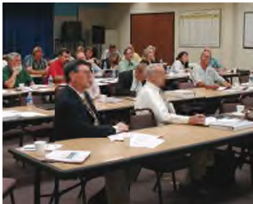
The Stakeholders discuss funding opportunities from the California Department of Water Resources.

These entities agreed that water resource needs in the Antelope Valley Region are highly interconnected and require a broad and integrated perspective in order to provide efficient and effective services.