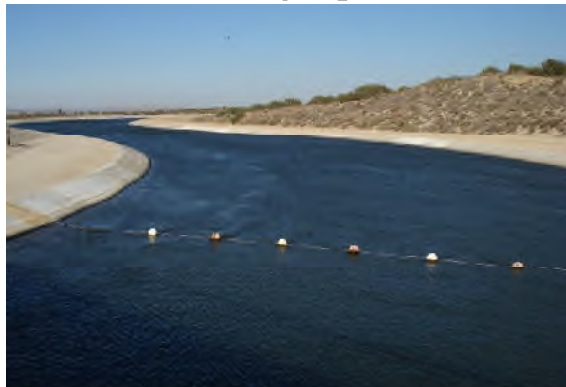
The State Water Project delivers imported water to the Antelope Valley.

Water supply for the Antelope Valley Region comes from three primary sources: the State Water Project (SWP), surface water stored in the Littlerock Reservoir, and the Antelope Valley Groundwater Basin. The Antelope Valley Region's SWP contractual Table A Amount is 165,000 acre-feet per year (AFY). With proper treatment, SWP water is generally high quality water well-suited for municipal and industrial (M&I) uses; however, the reliability of the SWP water supply is variable and is widely regarded to have decreased in recent years. Surface water stored at the