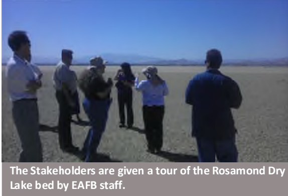
The Stakeholders are given a tour of the Rosamond Dry Lake bed by EAFB staff.

Region. This subsection lists all current stakeholders grouped into several categories and describes their roles in the planning process. The broad array of participants includes the agencies that comprise the RWMG as well as an extensive mix of other cities and regulatory, environmental, industrial, agricultural, and land-use planning agencies that represent all areas of the Antelope Valley Region. A brief discussion of coordination efforts with local planning, State, and Federal agencies is also provided where appropriate.