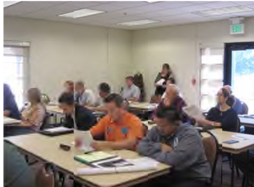
The Stakeholders are presented with the projects proposed for inclusion in the Plan

New projects must go through the submittal process. New projects selected for inclusion in the 2013 IRWM Plan Update were submitted in three ways: (1) by email using an electronic or scanned form, (2) on the www.avwaterplan.org website using an electronic form, and (3) with in-person meetings between project proponents and consultants during the Plan Updates. After submittal, the website information was updated with the assistance of LACDPW. The master list of IRWM projects (i.e., accepted into the IRWMP) is maintained on the www.avwaterplan.org website. Before projects are considered to be accepted into the IRWM Plan, they must go through the review process described below. A database of submitted projects that have not yet been accepted into the IRWM Plan is maintained separately from the master projects list on the website. Once projects go through the review process, they may be included in the master projects list. After the 2013 IRWM Plan Updates are complete, all project proponents will be encouraged to submit new projects and updates by logging in to the website and entering project information directly.